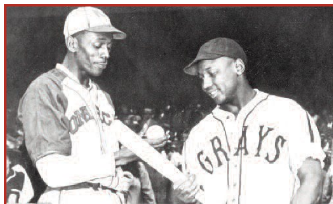
Satchel Paige and Josh Gibson, Negro League Baseball stars!