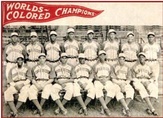
TOP, l-r: The Monarchs 1941 World's Colored Champions and Jackie Robinson; (2nd row, l-r) Buck O'Neil and J.L. Wilkinson.